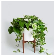
b) Money plant ✓