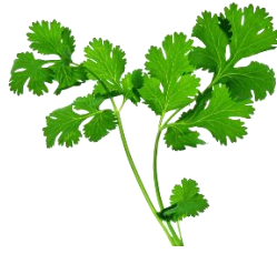
b) Coriander ✓