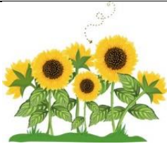
a) Sunflower ✓

6. Identify the shrub and put a tick (✓) on the picture which are given below: