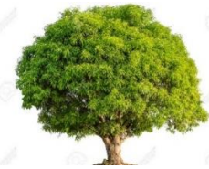
c) Mango tree

7. Identify the creeper and put a tick (✓) on the picture which are given below: