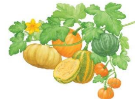
c) Pumpkin ✓

8. Identify the climber and put a tick (✓) on the picture which are given below: